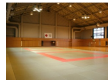
Tokorozawa Shimin Budokan

2 nd seminar by Yasuo Kobayashi soshihan: 11:45 – 12:45