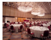
Hotel Grand Palace